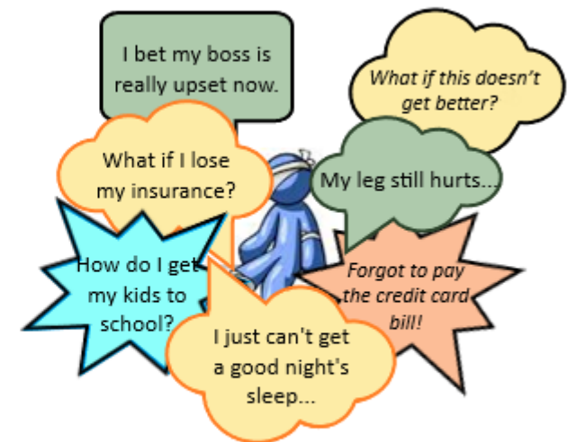
Worker's Perspective of Injury